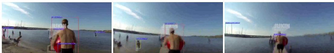
Figure 1 The visualization of the faster rcnn. I have a github tutorial on this topic

https://github.com/andrewliao11/py-faster-rcnn )